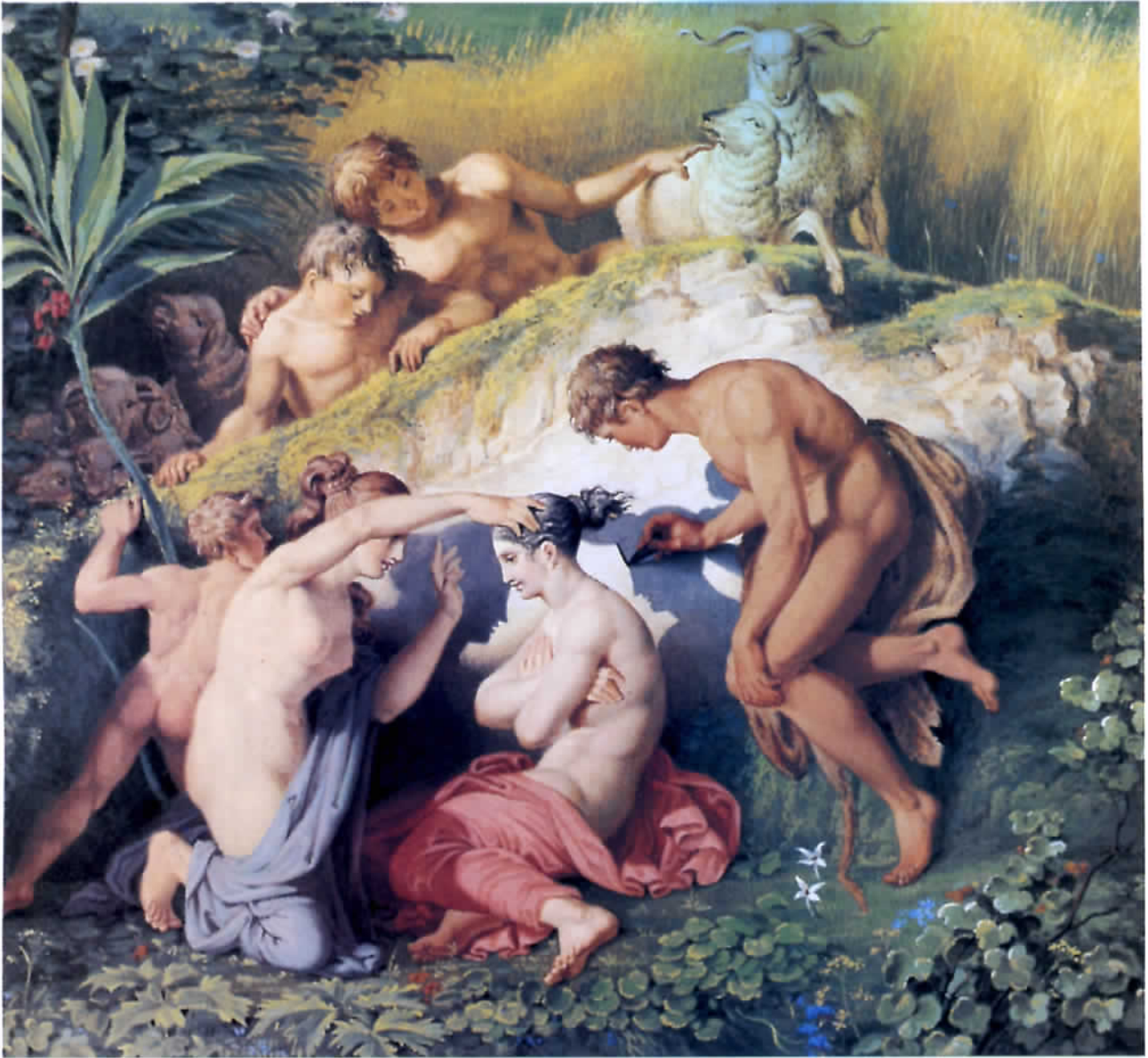
1.1 Tracing an image by hand: Karl Friedrich Schinkel, The Invention of Drawing , 1830. Von-der-Heydt- Museum, Wuppertal.