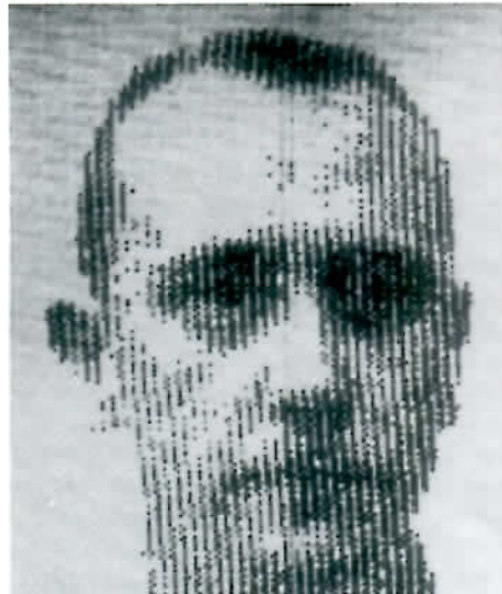
1.3 One of the first digital images: this picture was scanned from a photograph by the NBS mechanical drum scanner, processed by the SEAC computer, and displayed on an oscilloscope.