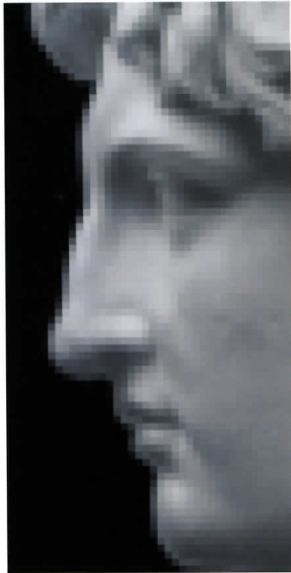
1.4 Enlargement of a digital image: smooth curves and continuous gradients are approximated by discrete pixels.

But images are encoded digitally by uniformly subdividing the picture plane into a finite Cartesian grid of cells (known as pixels ) and specifying the intensity or color of each cell by means of an integer number drawn from some limited range. 8 The resulting two-dimensional array of integers (the raster grid ) can be stored in computer memory, transmitted electronically, and interpreted by various devices to produce displays and printed images. In such images, unlike photographs, fine details and smooth curves are approximated to the grid, and continuous tonal gradients are broken up into discrete steps (figure 1.4).